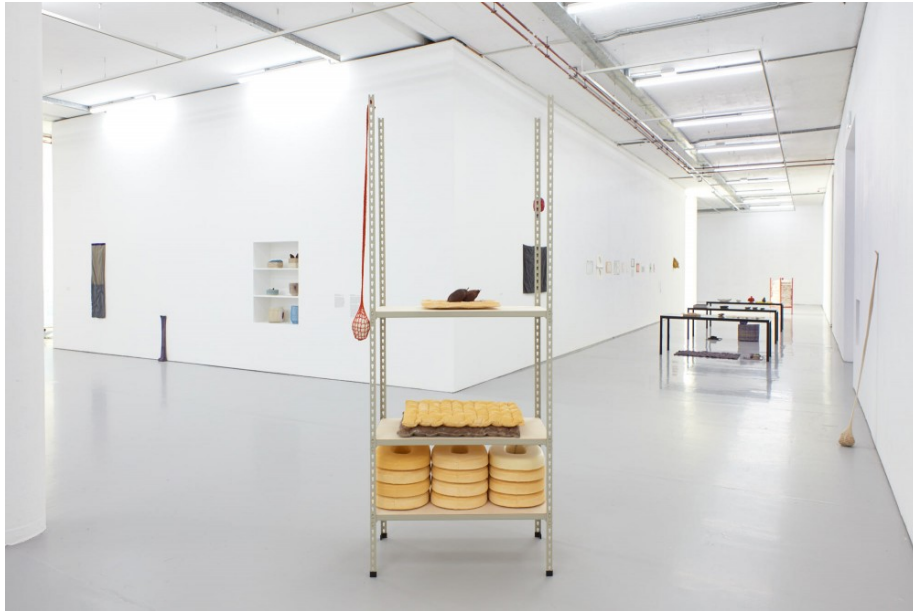
Fig. 4 Installation view of Veronica Ryan: Along a Spectrum at Spike Island, Bristol, 2021. (Courtesy Spike Island, Bristol, Paula Cooper Gallery, New York, and Alison Jacques, London; photograph Max McClure).