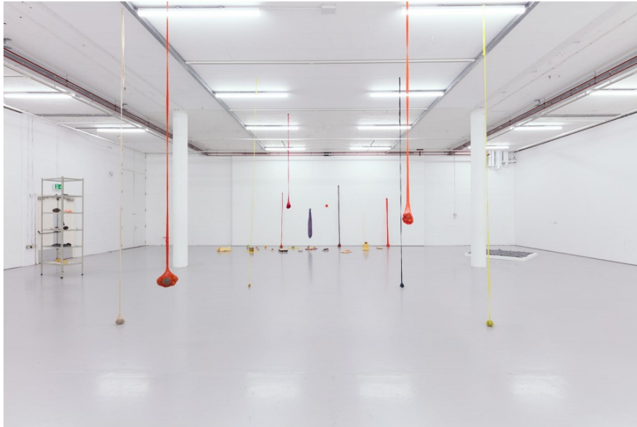
Fig. 6 Installation view of Veronica Ryan: Along a Spectrum at Spike Island, Bristol, 2021. (Courtesy Spike Island, Bristol, Paula Cooper Gallery, New York, and Alison Jacques, London; photograph Max McClure).