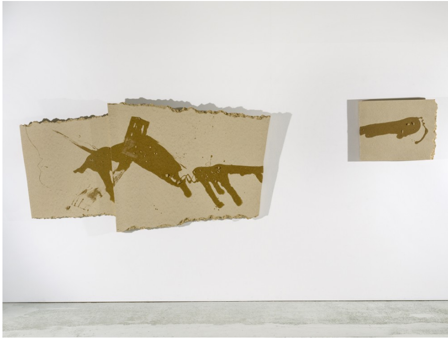
Fig. 3 MM 02 , by Thilo Heinzmann. 2019. Resin on chipboard, two pieces: 60 by 90 cm and 140 by 280 cm. (© Thilo Heinzmann; exh. neugerriemschneider, Berlin).