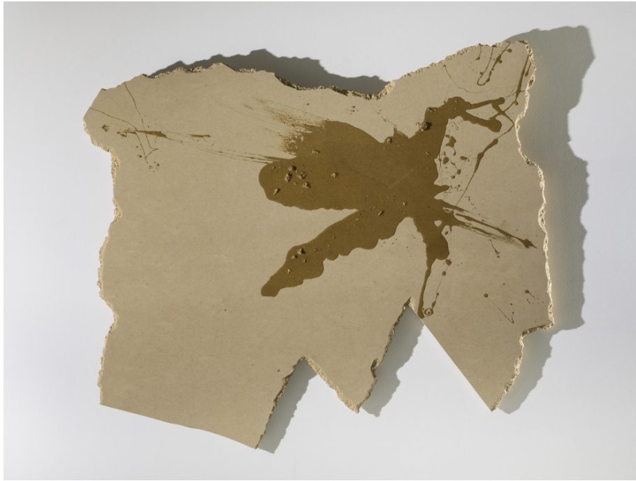
Fig. 5 MM 03 , by Thilo Heinzmann. 2019. Resin on chipboard, 200 by 250 cm. (© Thilo Heinzmann; photograph Roman März; exh. neugerriemschneider, Berlin).