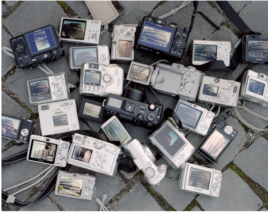
Fig. 8 Colosseum Pictures , from the series The New Antiquity , by Tim Davis. 2009. Archival inkjet print, 55 by 70 cm. (Courtesy the artist; exh. Kunstverein Ludwigshafen).