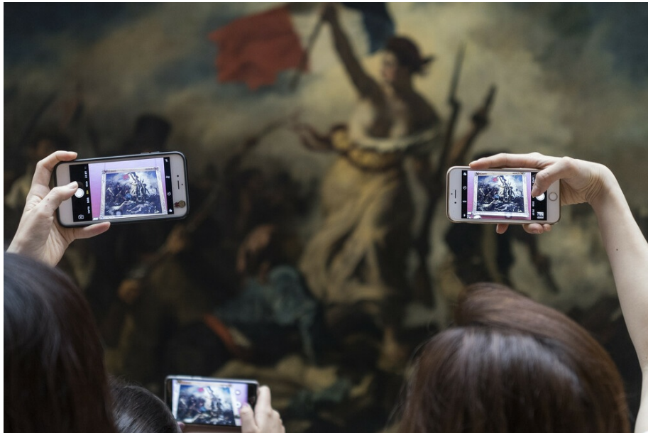
Fig. 9 July 28, 1830. Liberty Leading the People (Eugène Delacroix) , by Antonio Pérez Río. 2017. Inkjet print, 50 by 75 cm. (Courtesy the artist; exh. Kunstverein Ludwigshafen).