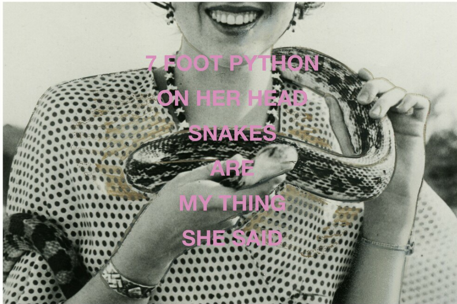
Fig. 3 From the series Snake , by Clare Strand. 2017. Archival photograph with hand printed screen print, text overlaid, floated on white glazed frame, 101.6 by 152.4 cm. (Courtesy Parrotta Contemporary Art, Köln/Bonn; exh. Heidelberger Kunstverein).

Although the work included directly references the digital image, the exhibition All Art is Photography presents the medium as always in relation to art. Tim Davis's series Colosseum pictures , which depicts the screens of several digital cameras showing images of the infinitely reproduced landmark in Rome, captures 'a very particular moment in the history of digital photography, just before smart phone cameras' FIG.8 . 14 Antonio Pérez Rio's series Masterpieces from 2014–18 captures smart phones being used to take photographs of famous paintings, perhaps with a view to sharing these on social media FIG.9 . Claudia Angelmaier's Blauracke depicts several books containing reproductions of the same work of art, revealing stark differences in colour and quality FIG.10 . Much like Levine's photographs, Angelmaier's series demonstrates photography's dual relationship to art: 'on the one hand, it can be an art in itself, expressive, subjective, inventive. On the other, it can be the means by which all the other visual arts—from painting to sculpture, to performance and site-specific art (such as Land Art), can be documented, reproduced, publicized, and disseminated'. 15