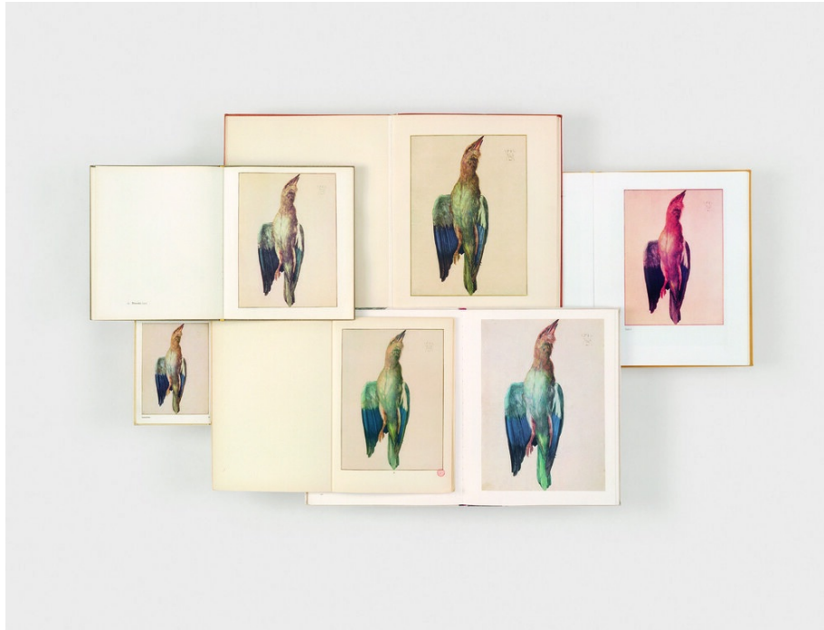
Fig. 10 Blauracke , from the series Plants and Animals , by Claudia Angelmaier. 2004. Analogue c-print, 105 by 128 cm. (© VG Bild-Kunst, Bonn 2020; exh. Kunstverein Ludwigshafen).