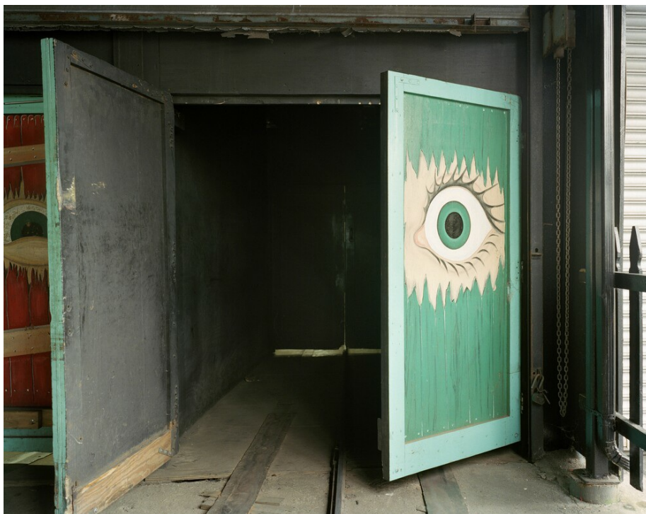
Fig. 5 Spook-A-Rama, Deno's , from the series Fun and Games, Coney Island, New York , by Lisa Kereszi. 2004. C-print, 76.2 by 101.6 cm. (Courtesy Yancey)