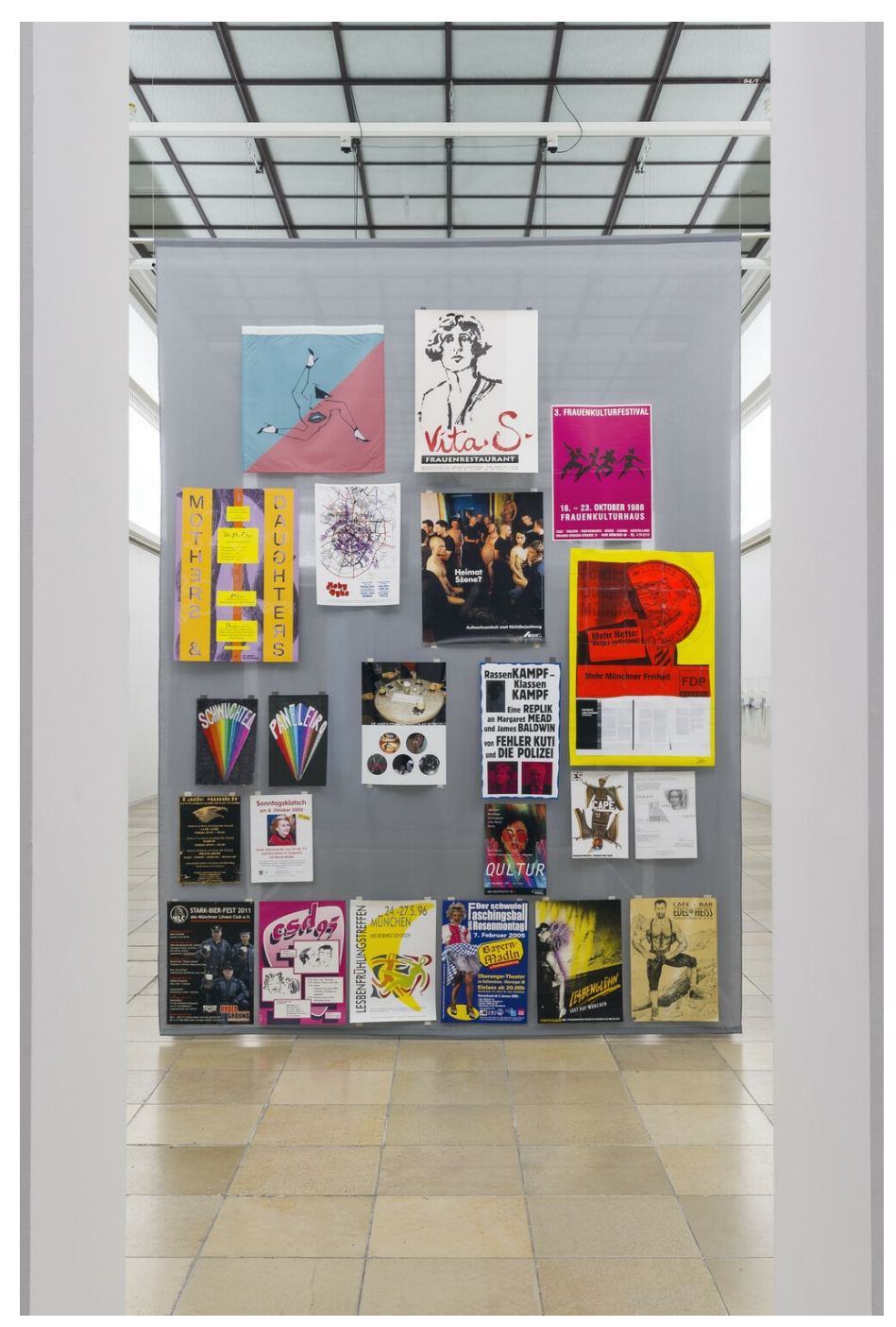
Fig. 5 I wanna give you devotion , by Philipp Gufler. 2017-ongoing. (exh. Haus der Kunst, Munich).