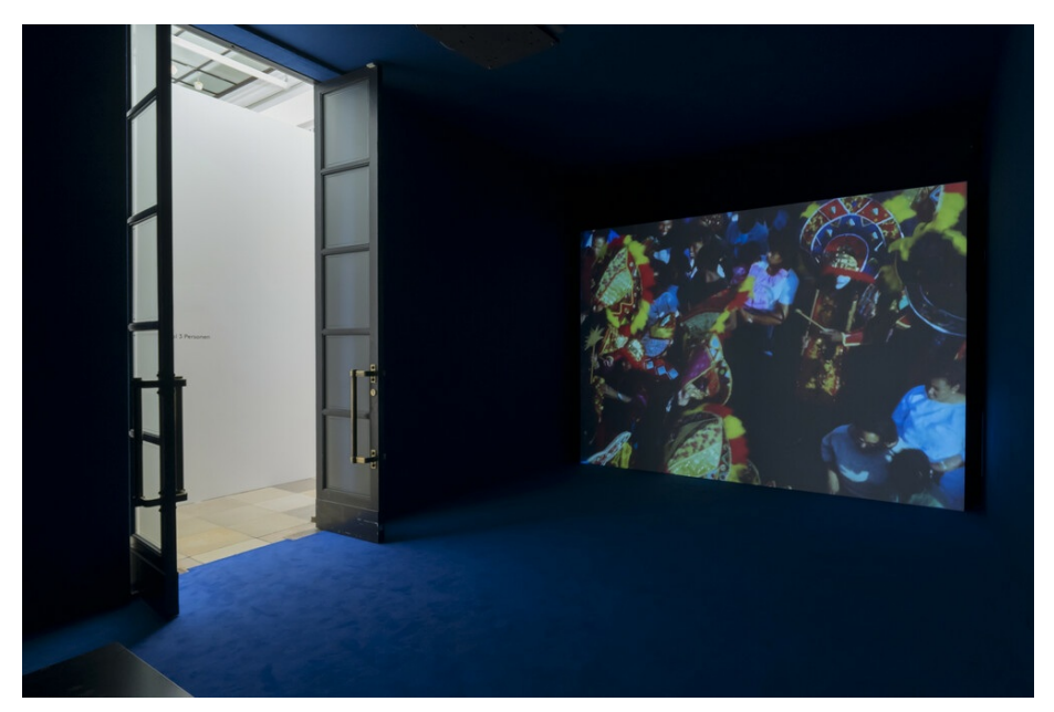
Fig. 2 Installation view of Sweαt at Haus der Kunst, Munich, 2021, showing Territories , by Issac Julien. 1984. 16mm film, duration 25 minutes. (Photograph Maximilian Geuter).

#2, 1797) (2017–20), is reminiscent of an armed horseman, recalling the British invasion of Puerto Rico's capital, San Juan, in the late eighteenth-century where the British army was defeated. Xa's recycled myths and Lind-Ramos's historical leftovers of national identity refer to persisting colonial issues in a non-didactic manner, enabling the viewer to explore such colonial references for themselves.