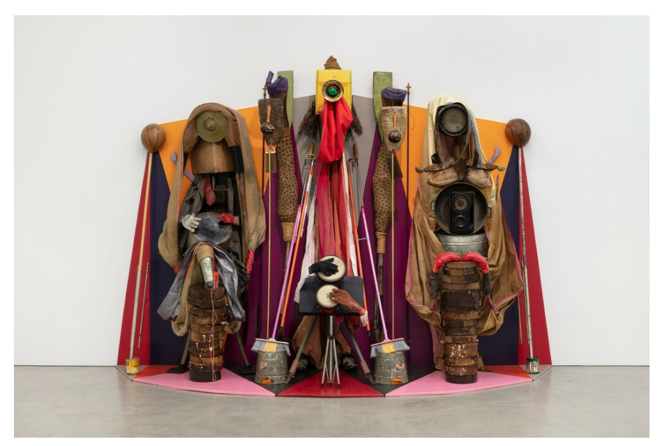
Fig. 4 Con-junto (The Ensemble), by Daniel Lind-Ramos. 2015. Steel, aluminium, nails, metal buckets, paint buckets, casseroles, palm tree branches, dried coconuts, branches, palm tree trunks, wood panels, burlap, machetes, leather, ropes, sequin, awning, plastic ropes, fabric, trumpet, cymbals, speaker, pins and duct tape, 289 by 304 by 121 cm. (Courtesy Scott Mueller Collection; photograph Pierre Le Hors; exh. Haus der Kunst, Munich).

subsumption to them.<sup>5</sup> However, despite the show's optimistic body politics, the colonisers' debt remains, as Harney and Moten state: 'it can't be repaired. The only thing we can do is tear this shit down completely and build something new'.<sup>6</sup>