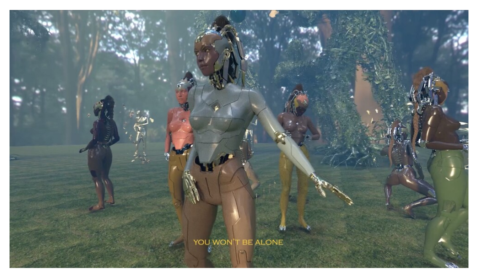
Fig. 8 Still from We Are In Hell When We Hurt Each Other , by Jacolby Satterwhite. 2020. HD colour video and 3D animation with sound, duration 24 minutes 22 seconds. (Courtesy the artist and Mitchell-Innes & Nash, New York; exh. Haus der Kunst, Munich).