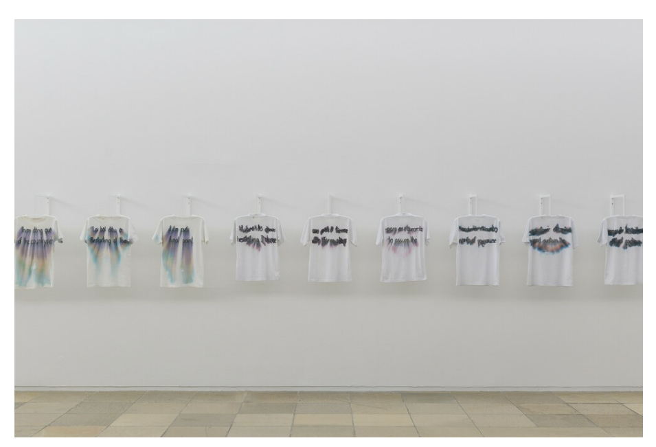
Fig. 7 Dancing Southward, by Santiago Reyes. 2016-ongoing. (exh. Haus der Kunst, Munich).