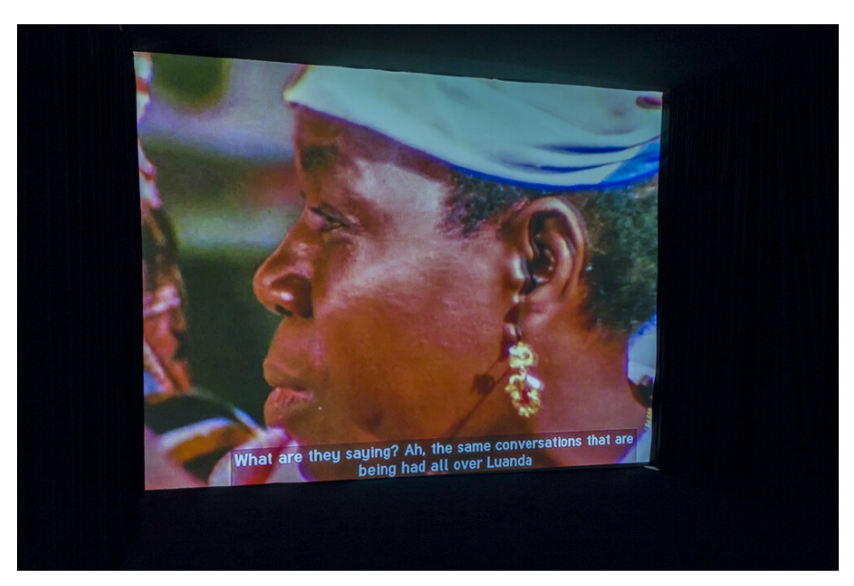
Fig. 1 Installation view of Sweat at Haus der Kunst, Munich, 2021, showing Carnaval da Vitória , by António Ole. 1978. Video, duration 40 minutes. (Photograph Maximilian Geuter).

In the accompanying publication, the scholar André Lepecki outlines the paradoxical cultural implications of contemporary carnival celebrations. He notes that, on one hand, they operate according to the 'logic of State power', now the 'post-colonial nation State' as a 'choreographed performance' that reifies 'people's joy and sweat'. On the other hand, 'the people dancing carnival', Lepecki stresses, are 'liberated people' (p.163). The juxtaposition of Carnaval da Vitóriα and Territories, which show the Southern African decolonialised form of carnival celebration and the cultural aftermath of the British Empire, reminds us how Western colonisers shaped the lives of those they subjugated. These films despite capturing the carnivalesque liberation that Lepecki references - highlight the persistence of racial discrimination, as the carnival, now in its liberal form, is still performed within a 'white' capitalist framework.