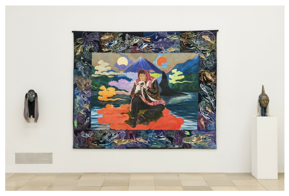
Fig. 3 Installation view of Sweat at Haus der Kunst, Munich, 2021, showing works by Xadie Za.

Rezaire's commentary is furthered by the video SAMBA #2 (2014) by the Brazilian artist duo chameckilerner (Rosane Chamecki, b.1964, and Andrea Lerner, b.1966). It shows a female samba dancer moving in slow motion, as the camera zooms in on her wobbling flesh. The focused camera view alienates her body, transforming it into an abstracted form of sexuality.