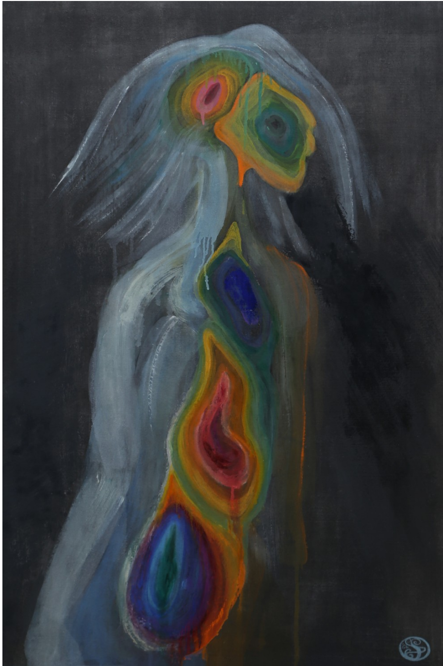
Fig. 4 Oil and Water Nymph , by Ithell Colquhoun. 1964. Oil on board, 108 by 73 cm. (Courtesy Richard Shillitoe; © Samaritans, Noise Abatement Society and Spire Healthcare).