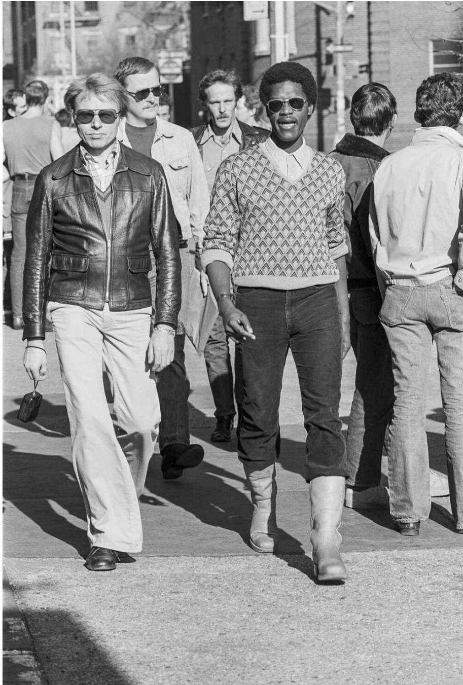
Fig. 1 Untitled #22 , from the series Christopher Street , by Sunil Gupta. 1976. (Courtesy the artist and Hales Gallery, Stephen Bulger Gallery and Vadehra Art Gallery; © Sunil Gupta; All Rights Reserved, DACS 2020; exh. The Photographers' Gallery , London).

Gupta has continually explored how photographs can challenge the prevailing cultural invisibility of his social and political milieu as an Indian gay man, active in the gay liberation movement in Montréal following his family's emigration to Canada in 1969, and participating in Black cultural activism and nascent AIDS and queer activism in Britain after his relocation to London in 1977. It would, however, be a mistake to read his work as biographical, for Gupta's project has always been directed at the gallery as a political space, aiming to remake art into a realm capable of celebrating illicit and subaltern desire. This exhibition emphasises