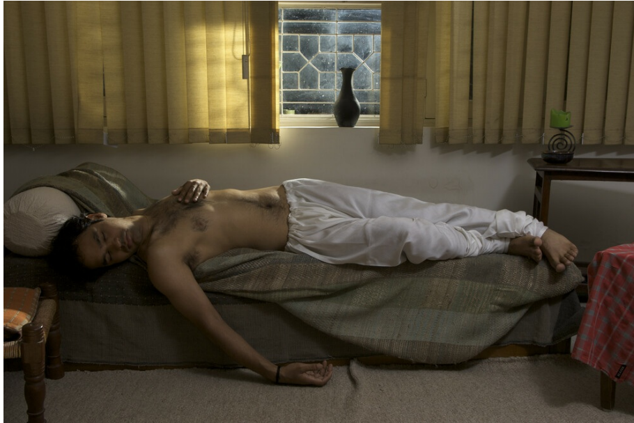
Fig. 3 Untitled #7 , from the series The New Pre-Raphaelites , by Sunil Gupta. 2008. (Courtesy the artist and Hales Gallery, Stephen Bulger Gallery and Vadehra Art Gallery; © Sunil Gupta; All Rights Reserved, DACS 2020; exh. The Photographers' Gallery, London).

exhibition, a family album reframed to represent the reach of diasporic subjectivity beyond 'Fortress Europe' or any other singular national formation.