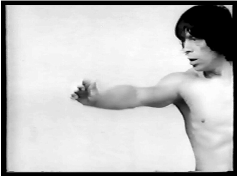
Fig. 2 Still from No More , by Mairéad McClean. 2014. Digital video, 16 mins. (Courtesy the artist).

James Boaden examines British work that dwells on irresolvable social antagonisms, especially in a fine reading of Julien, whose reflections on race and gay sexuality stand in contrast to the simpler and more positive views of some North American critics FIG.3 . Melissa Gronlund maps the critical arm of moving image in the 'young British art' generation and the way that it was used to question the national culture.