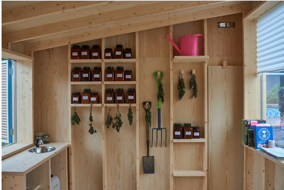
Fig. 7 Detail from Bothy: Congregation (creating dangerously remix) , by Alberta Whittle. 2022. Exterior painted treated pine, corrugated steel, interior engineered pine and pine veneer. (exh. Grand Union, Birmingham).