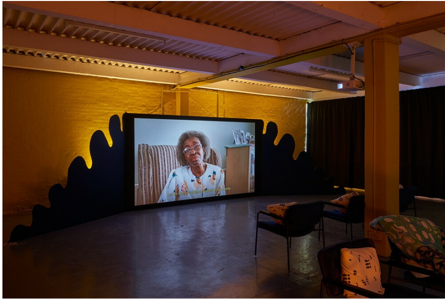
Fig. 1 Installation view of Alberta Whittle: We gather and dream of a new congregation at Grand Union Gallery, Birmingham, 2022.