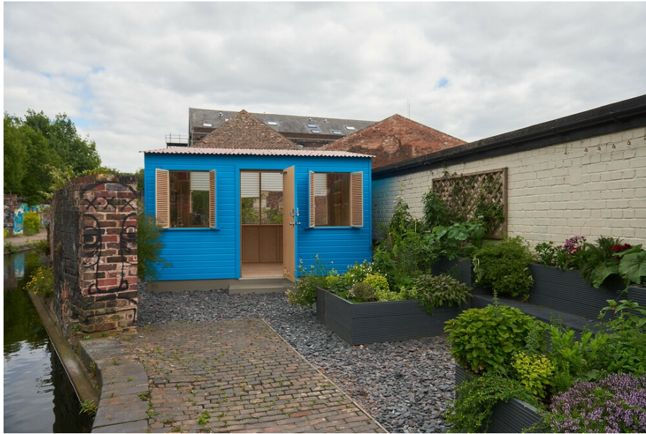
Fig. 5 Installation view of Alberta Whittle: We gather and dream of a new congregation at Grand Union Gallery, Birmingham, 2022.