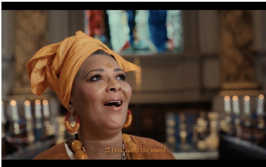
Fig. 2 Still from Congregation (creating dangerously) , by Alberta Whittle. 2022. Single-channel video, duration 35 minutes.