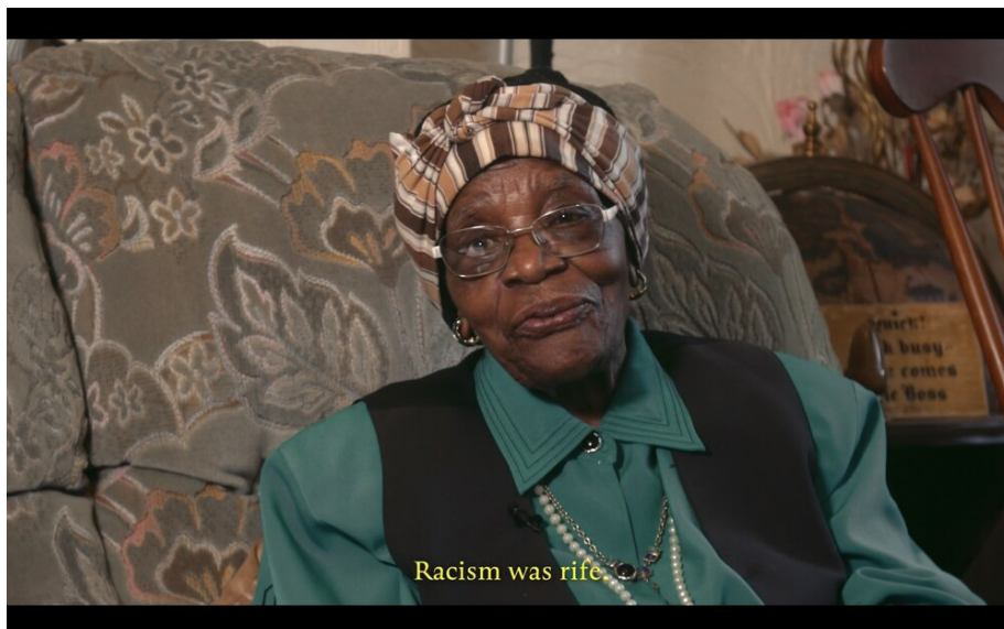
Fig. 4 Still from Making family through listening to the land , by Alberta Whittle. 2022. Single-channel video, duration 47 minutes 49 seconds.