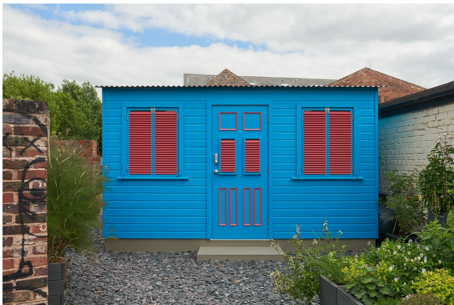
Fig. 6 Bothy: Congregation (creating dangerously remix) , by Alberta Whittle. 2022. Exterior painted treated pine, corrugated steel, interior engineered pine and pine veneer. (exh. Grand Union, Birmingham).