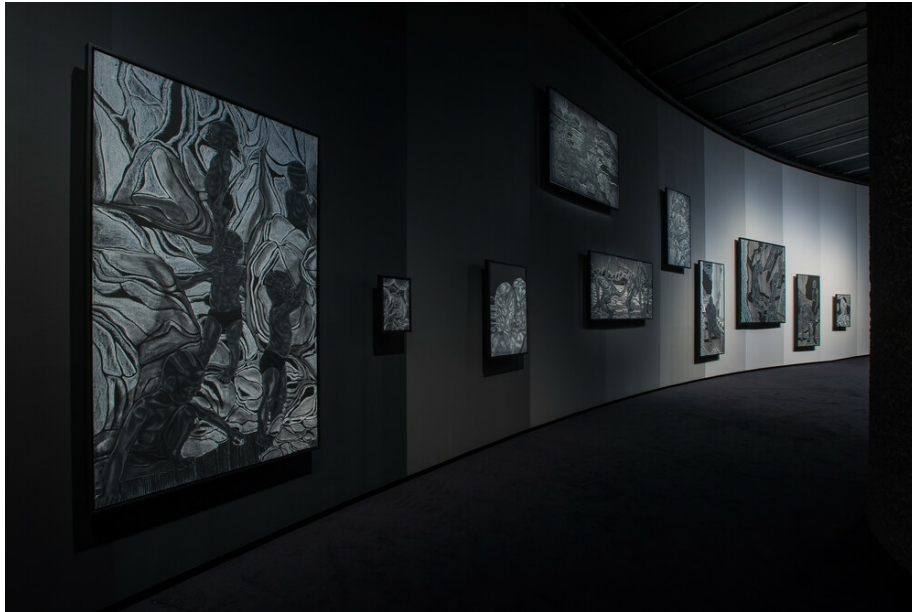
Fig. 2 Installation view of Toyin Ojih Odutola: A Countervailing Theory at the Barbican Art Gallery, London, 2020. (© Toyin Ojih Odutola. Courtesy the artist and Jack Shainman Gallery, New York; photograph Max Colson).

Importantly though, Ojih Odutola's narratives are not locked in idealism. They are closer to parables than descriptions of potential futures or reconstructions of violently suppressed pasts. If A Wanderer Determined describes a world where the persecution of gender and sexual differences are overturned, then it is still one in which wealth and power are braided together and sustained through genealogy. A Countervailing Theory presents an even clearer lesson traced across its blackboard-like panels. In the story within the story, the two central protagonists, Akanke, of the ruling Eshu FIG.5 , and Aldo, of the labouring Koba, begin to overcome their respective social statuses to listen to each other. They meet each other as equals, sharing in an act of cunnilingus as depicted in Accepting Impermanence FIG.6 . But this mutual recognition is not enough to save Aldo after he is falsely accused of murdering another Eshu; Akanke leaves him to be executed, later realising she is pregnant with twins. In her telling of this story in the accompanying book, Ojih Odutola emphasises that Akanke and Aldo's coming together could 'bring the whole system down. But they fail'. 3 As such, the artist extricates the parable from identity or history and refocuses it on the corrupting dynamics of power, which is shown to be the unquestioned foundation of this civilisation.