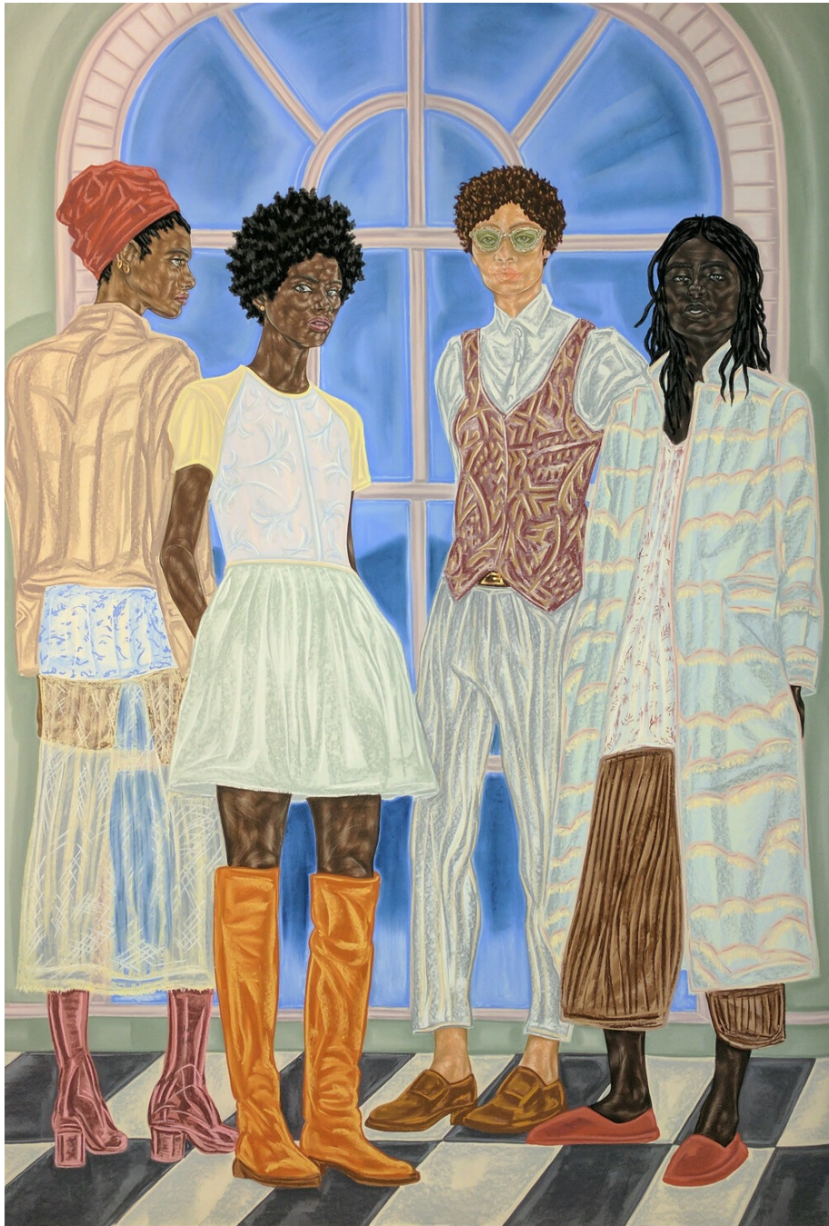
Fig. 4 Representatives of State from To Wander Determined by Toyin Ojih Odutola . 2016–17. Pastel, charcoal and pencil on paper, 191.8 by 127 cm. (© Toyin Ojih Odutola. Courtesy the artist and Jack Shainman Gallery, New York; exh. Barbican Art Gallery, London).

the full extent of its meaning'. Ojih Odutola offers us an invitation to re-engage with the violence of history and to learn from a parable about power.