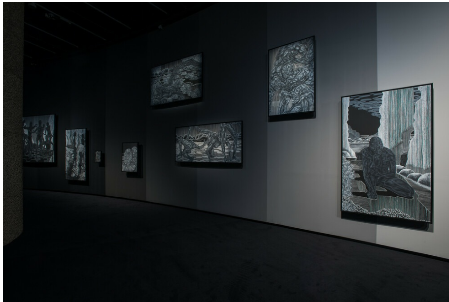
Fig. 1 Installation view of Toyin Ojih Odutola: A Countervailing Theory at the Barbican Art Gallery, London, 2020. (© Toyin Ojih Odutola. Courtesy the artist and Jack Shainman Gallery, New York; photograph Max Colson).