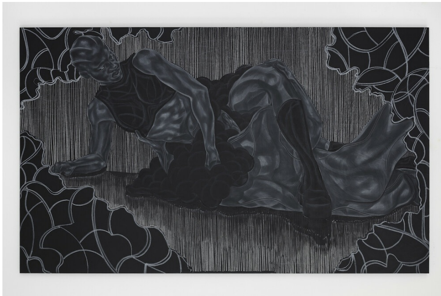
Fig. 6 Accepting Impermanence from A Countervailing Theory by Toyin Ojih Odutola. 2019. (© Toyin Ojih Odutola. Courtesy the artist and Jack Shainman Gallery, New York; exh. Barbican Art Gallery, London).