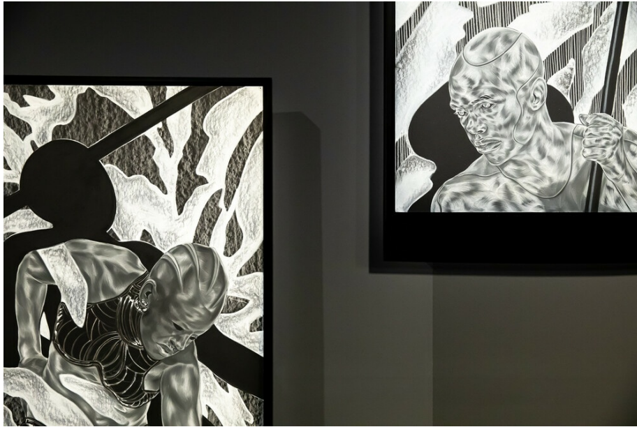
Fig. 3 Installation view of Toyin Ojih Odutola: A Countervailing Theory at the Barbican Art Gallery, London, 2020. (© Toyin Ojih Odutola. Courtesy the artist and Jack Shainman Gallery, New York; photograph Max Colson).

The clarity of the parable form finds a parallel in the monochromatic works that make up A Countervailing Theory . Both humans and landscape are described with shading and blending, although the black of the background is never completely worked over – it remains to mark the striations on the bodies of the Eshu and the Koba FIG.7 , elements of the landscape and the shadows of the figures, which according to Ojih Odutola’s narrative represent the consciousness of her characters. The interrelation between fore and background and between chalk and charcoal also structures the relationship between the depicted bodies and their landscape. They are interconnected – made from the same stuff – and the use of charcoal and chalk mirrors the unknown substances being mined in the images.