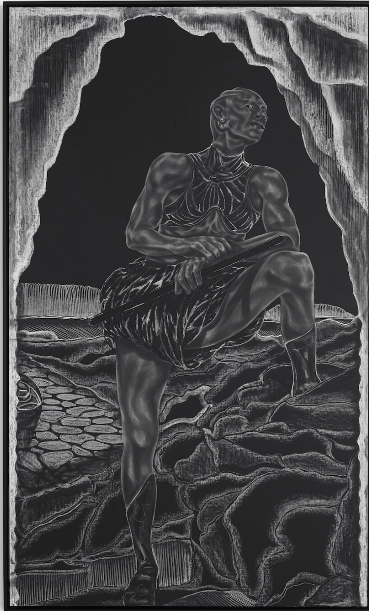
Fig. 5 The Ruling Class (Eshu) from A Countervailing Theory by Toyin Ojih Odutola. 2019. (© Toyin Ojih Odutola. Courtesy of the artist and Jack Shainman Gallery, New York; exh. Barbican Art Gallery, London).