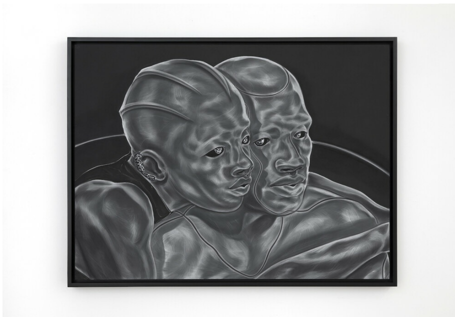
Fig. 7 Imitation Lesson; Her Shadowed Influence from A Countervailing Theory by Toyin Ojih Odutola. 2019. (© Toyin Ojih Odutola. Courtesy the artist and Jack Shainman Gallery, New York; exh. Barbican Art Gallery, London).

Exhibition details Toyin Ojih Odutola: A Countervailing Theory Barbican Art Gallery, London 11th August 2020–24th January 2021