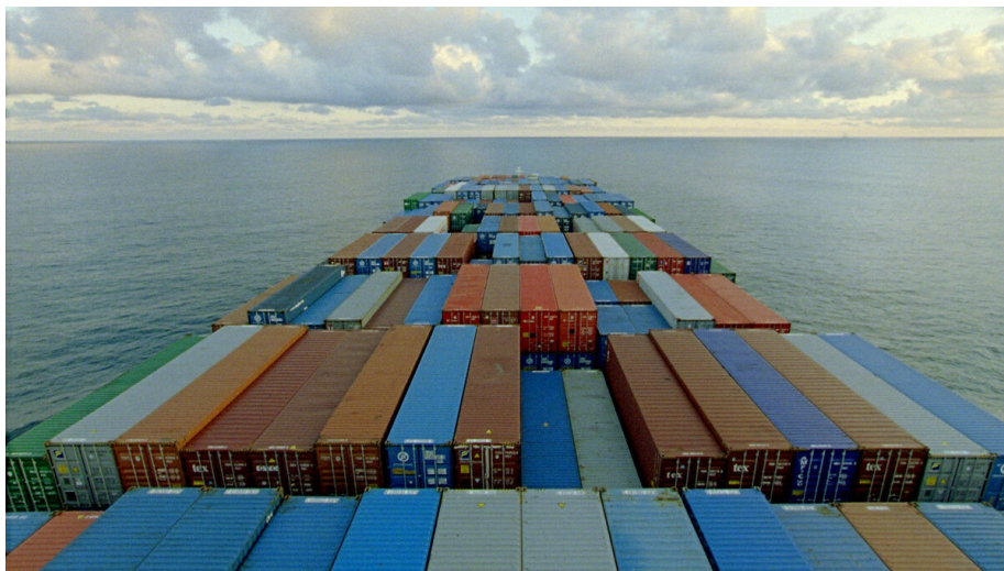
FIG. 3 Still from The Forgotten Space , by Allan Sekula and Noël Bursch. 2010. Film. (Courtesy the artists).