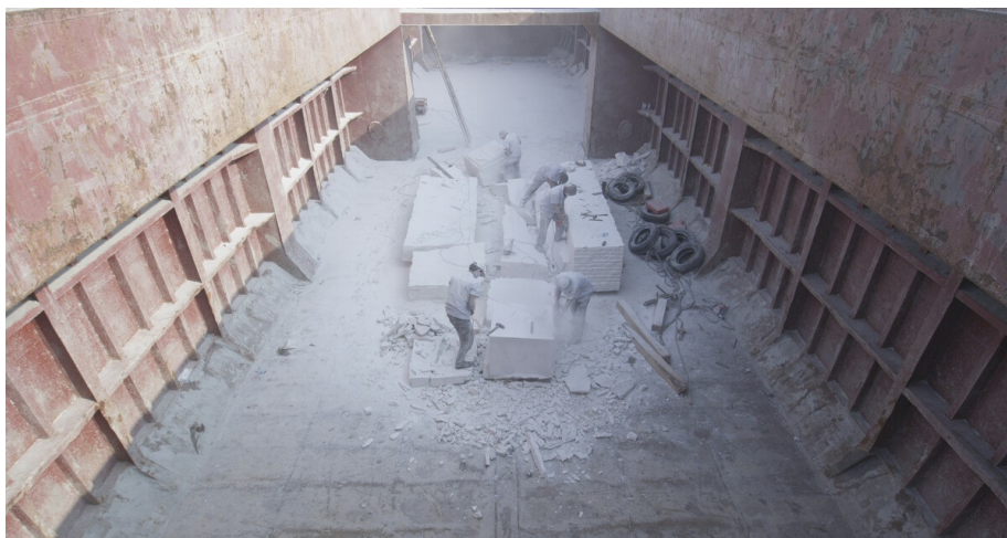
FIG. 4 Still from The Column , by Adrian Paci. 2013.

The aesthetic cohesion of the video is striking, particularly as it