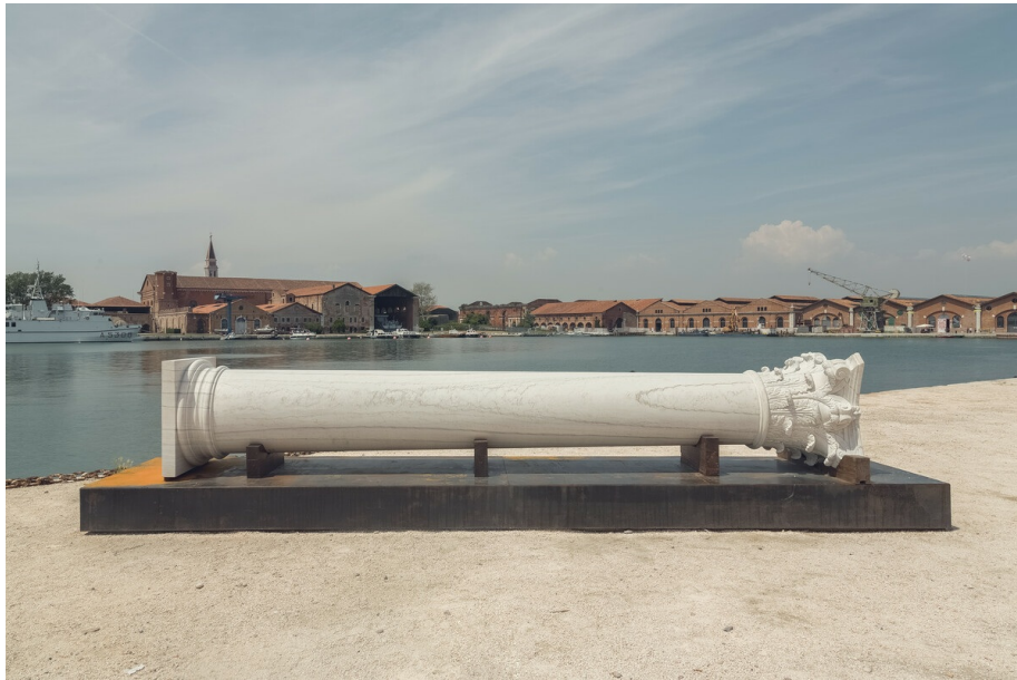
FIG. 8 Still from The Column , by Adrian Paci. 2013. (Courtesy the artist; kaufmann repetto, Milano and New York; and Peter Kilchmann, Zurich).

In display, the column is typically exhibited out of doors, reclining on its side FIG. 8 . While this recumbent position mirrors its arrangement in the video, to be horizontal also undermines the column's powerful form, rendering it impotent. Certainly, as an architectural object the column is a symbol of Western colonialism, both in terms of historical projects of national expansion, and in more contemporary economic and political relationships. Positioned thus, its power has perhaps been revoked.