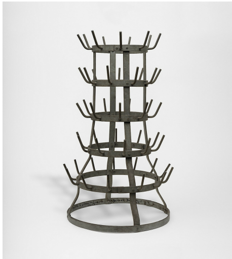
FIG. 6 Bottle rack , by Marcel Duchamp. 1914/59. Galvanised iron, 59.1 by 36.8 cm. (Art Institute Chicago).

exposing how art – including his own – benefits from uneven economic systems. 12