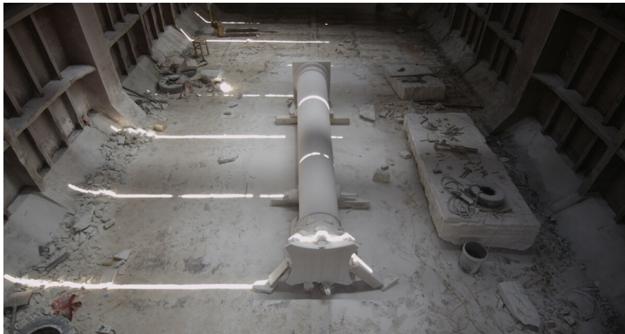
FIG. 5 Still from The Column , by Adrian Paci. 2013.

Such questions of artistic labour have a long history in avant-garde practice. Marcel Duchamp's readymade sculptures, such as Bottle rack FIG. 6, actively complicated the notion of artistic labour, broadening the scope of what constituted a work of art by rearranging art's aesthetic categories and reframing the relationship of the art object to processes of work. 8 Duchamp's contribution of labour to the readymades was his selection of each object as art; the objects themselves were manufactured elsewhere, originally mass-produced as ordinary household items. Esther Leslie has discussed this redistribution of artistic labour in the context of capitalist modes of production, arguing that the readymade became 'a model for the workings of the commodity system per se', because 'it brings into view the crucial categorical distinctions of the labour theory of value as a matter of aesthetic debate and cultural engagement'. 9