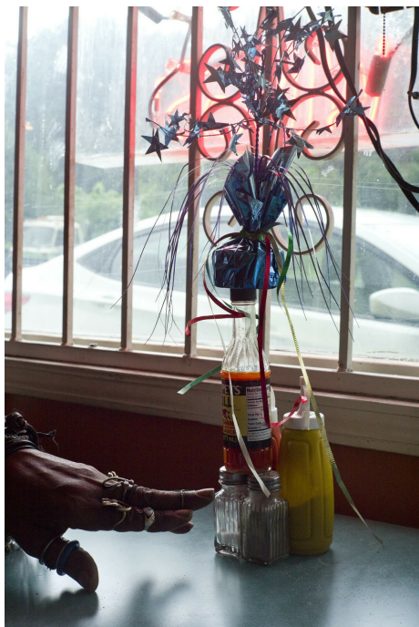
FIG. 6 Education by Lonnie Holley , by Hannah Collins. 2017. Giclée print, 30 by 40 cm. (Courtesy the artist).