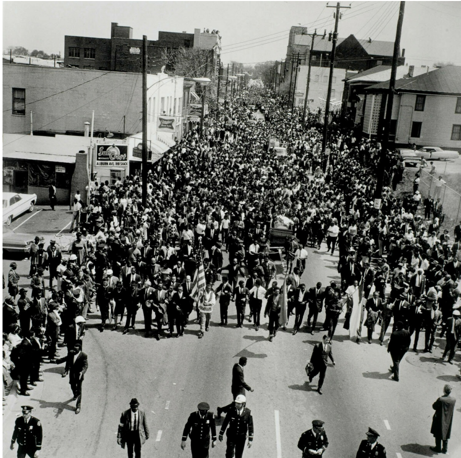
FIG. 21 Martin Luther King funeral procession, by Ernest Withers. 1968. Gelatin silver print, 36.2 by 36.2 cm. (High Museum of Art, Atlanta;).

Looking through hundreds of images prompted new interpretations about the power of protest and how detailed the planning and execution of specific acts during the movement had been. The march from Selma to Montgomery could be seen from the point of view of a marcher, looking towards those standing along the route – sometimes the photographer was watching children willing the march, marchers continuing when rain poured down, or teenagers lying on the ground recovering from their walk. The disconnection from one image to another prompted me to consider how such disconnections might allow a viewer space to think and draw pictures of their own. Documentary photographs provided a key to the exhibition. They act as an anchor, a way to view history that prevents the art from floating in an abstract modern space.