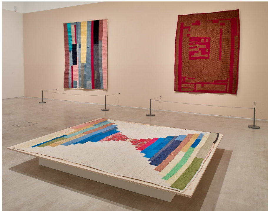
FIG. 22 Installation view of We Will Walk – Art and Resistance in the American South , Turner Contemporary, Margate, 7th February–3rd May 2020.