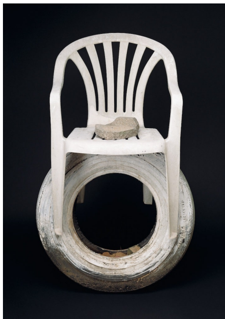
FIG. 8 Untitled , by Emmer Sewell. Early 1990s. Car tyre, plastic chair and cinderblock, 109.2 by 72.4 by 55.9 cm. (Metropolitan Museum of Art, New York; courtesy Souls Grown Deep, Atlanta).

The third encounter was with Emmer Sewell's work. I first saw an assemblage by Sewell in Alabama, shortly before the piece was acquired by the Metropolitan Museum of Art, New York in 2014 from the collector William Arnett. In the work, a white plastic chair and piece of grey concrete balance on a black rubber tyre daubed with white paint.