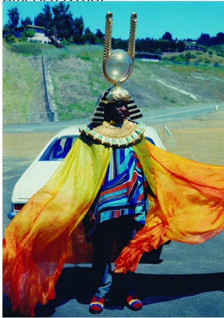
FIG. 24 Untitled (Sun Ra on the Set of Space is the Place). 1972. Modern photographic print.

In a final room recognising Purifoy's place in this project are works by artists who were born in the South and left as part of the many migrations by African Americans to other parts of the country. The Jazz musician Sun Ra (1914–93) spent many years in Chicago although he was born and is buried in Birmingham, Alabama. His film, Space is the Place (1974), a pioneering work of Afro-Futurism, imagines a utopian world for Black people, away from white supremacy. The critic and musician Greg Tate put it: