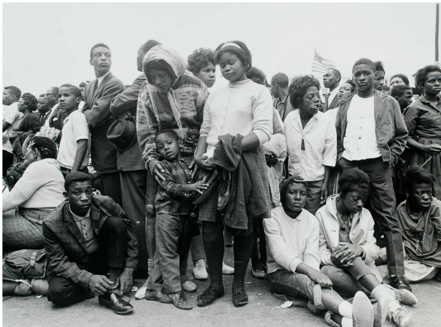
FIG. 20 Montgomery, Alabama, 1965. Gelatin silver print, 27 by 35 cm.