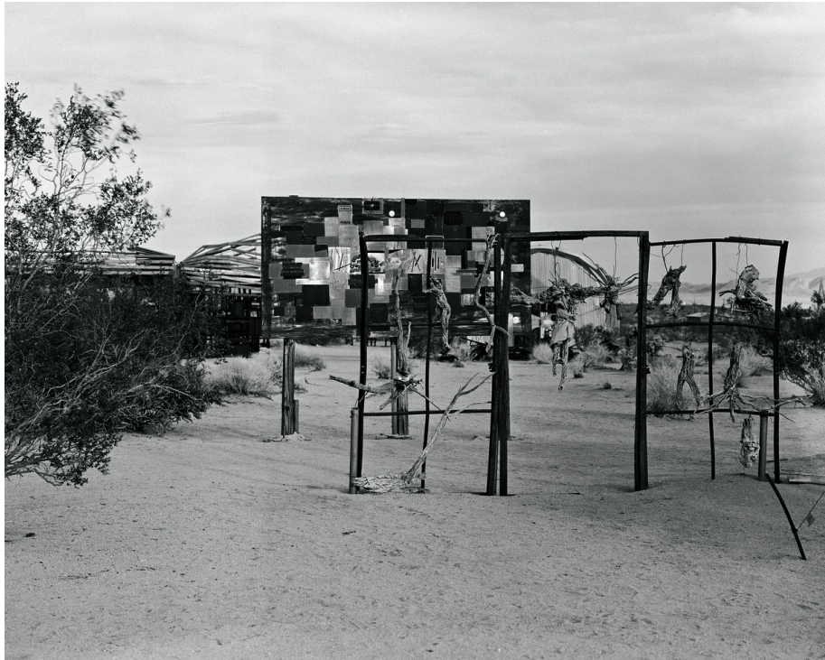
FIG. 1 The Interior and the Exterior - Noah Purifoy, No 5 , by Hannah Collins. 2014. Gelatin silver print, 139 by 83 cm. (Courtesy the artist).