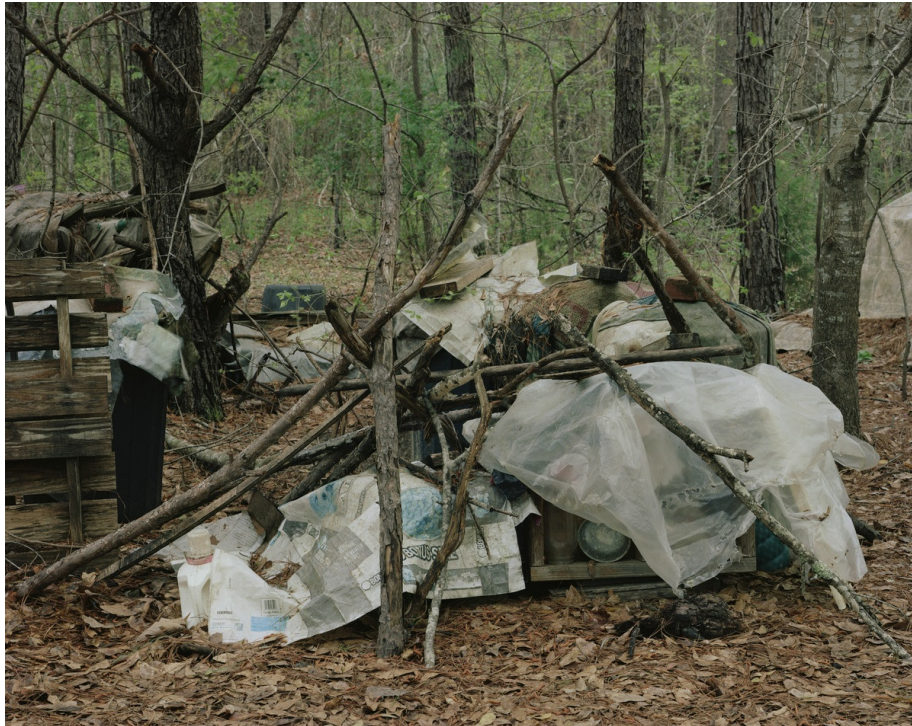
FIG. 14 Dinah Young's yard with structure , by Hannah Collins. 2018. Giclée print, 140 by 170 cm.