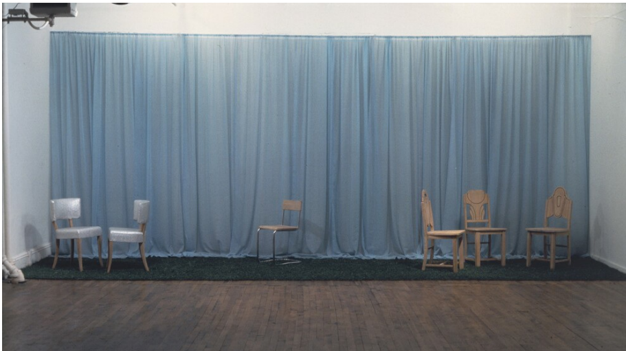
Fig. 8 Performance view of Pastoral Chair Tableaux , by Scott Burton. Colour transparency, 20 by 25.2 cm. (© Estate of Scott Burton; Museum of Modern Art Archives, New York; Scala, Florence; Art Resource, New York; exh. Pulitzer Arts Foundation, St Louis).