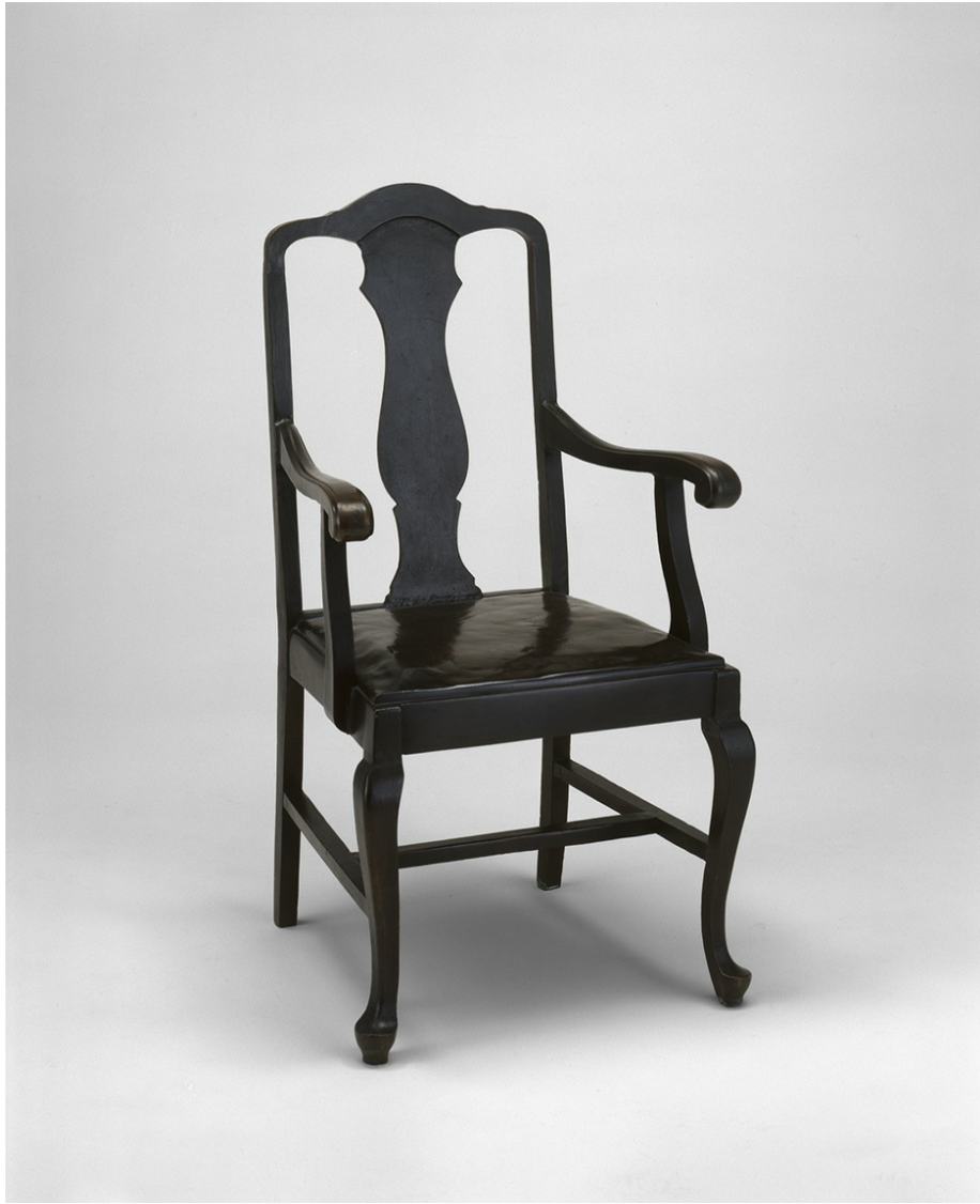
Fig. 9 Bronze Chair , by Scott Burton. 1972. Bronze, 121.9 by 45.7 by 50.8 cm. (© 2024 Estate of Scott Burton; Artists Rights Society, New York; Art Institute of Chicago; exh. Pulitzer Arts Foundation, St Louis).