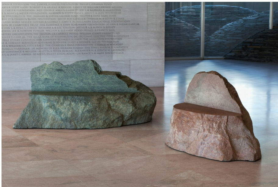
Fig. 13 Rock Settees , by Scott Burton. 1988. Granite, 2 pieces, overall dimensions 97.8 by 160 by 107.9 cm. (© Estate of Scott Burton and Artists Rights Society, New York; National Gallery of Art, Washington; courtesy National Gallery of Art, Washington).