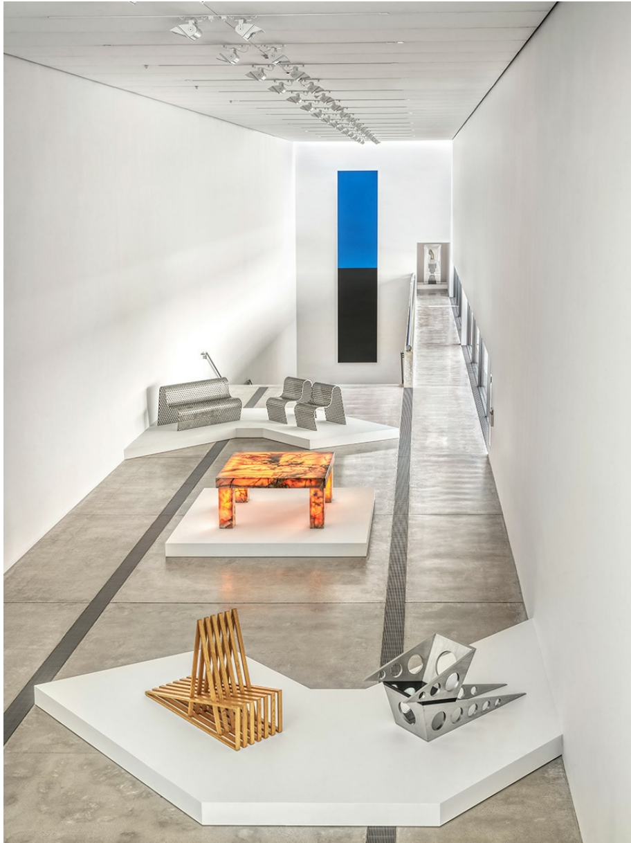
Fig. 11 Installation view of Scott Burton: Shape Shift at Pulitzer Arts Foundation, St. Louis, 2024-25. (© Estate of Scott Burton; Artists Rights Society, New York; photograph Alise O'Brien).