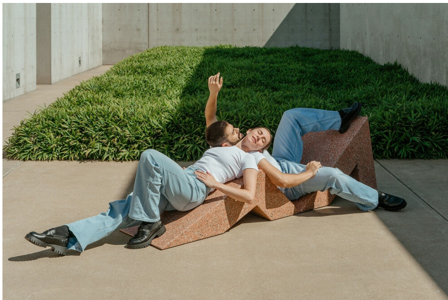
Fig. 15 In Two , by Brendan Fernandes, performed at Pulitzer Arts Foundation, St Louis, 2024–25. (© Brendan Fernandes; courtesy Pulitzer Arts Foundation, St Louis; photograph Virginia Harold).