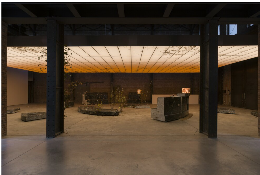
Fig. 2 Installation view of Álvaro Urbano: TABLEAU VIVANT at SculptureCenter, New York, 2024–25.

In TABLEAU VIVANT remnants salvaged from Atrium Furnishment , which was deinstalled and put into storage in 2020, are surrounded by steel-cast, painted plants and half-eaten apples made from concrete FIG.4 . A reprise of the semiotics of social interaction that fuel Burton's 'ruin in progress', Urbano's elegiac reanimation evokes the faux-wildness and meandering pathways of the Ramble in Central Park, long a favoured site for cruising. Tellingly, TABLEAU VIVANT also invokes Furniture Landscape FIG.5 , a formative installation that Burton staged at the University of Iowa in 1970, through its deft melding of public and private, nature and culture. In a densely wooded part of the campus, he installed a series of discrete 'rooms' furnished with worn vernacular objects – an armoire, desk and chair, bed and sofa patterned with vegetal motifs – and a framed landscape painting and a vase of flowers. Despite the overgrown abandon of the pastoral setting, references to Henry David Thoreau's utopian ideals were unmissable. Yet, Burton also hoped viewers would perceive affinities with Henri Rousseau's The Dream (1910; Museum of Modern Art, New York). In Le Douanier's beguiling, gendered fantasy, a female nude, reclining on a divan in a tropical rainforest, is watched over by a cohort of wild animals.