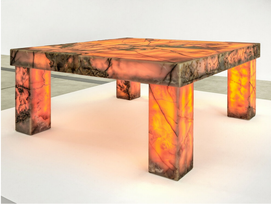
Fig. 7 Onyx Table , by Scott Burton. 1978–81. Onyx marble, steel and fluorescent lights, 75.6 by 158.1 by 151.8 cm. (© Estate of Scott Burton; Museum of Modern Art Archives, New York; courtesy Pulitzer Arts Foundation, St Louis; photograph Alise O'Brien; exh. Pulitzer Arts Foundation, St Louis).

exhibition-making at a time when axioms, definitive statements and fixed categories no longer serve.