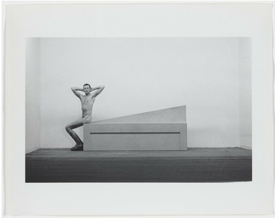
Fig. 14 Section III. Sexual Presentations [alternating aggressive and passive] , by Scott Burton. 1980. Gelatin silver print, 2.2 by 3.6 cm. (© Estate of Scott Burton; Museum of Modern Art Archives, New York; Scala, Florence; Art Resource, New York; exh. Pulitzer Arts Foundation, St Louis).