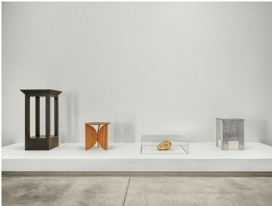
Fig. 17 Installation view of Scott Burton: Shape Shift at Pulitzer Arts Foundation, St Louis, 2024-25. (© Estate of Scott Burton; Artists Rights Society, New York; photograph Alise O'Brien).