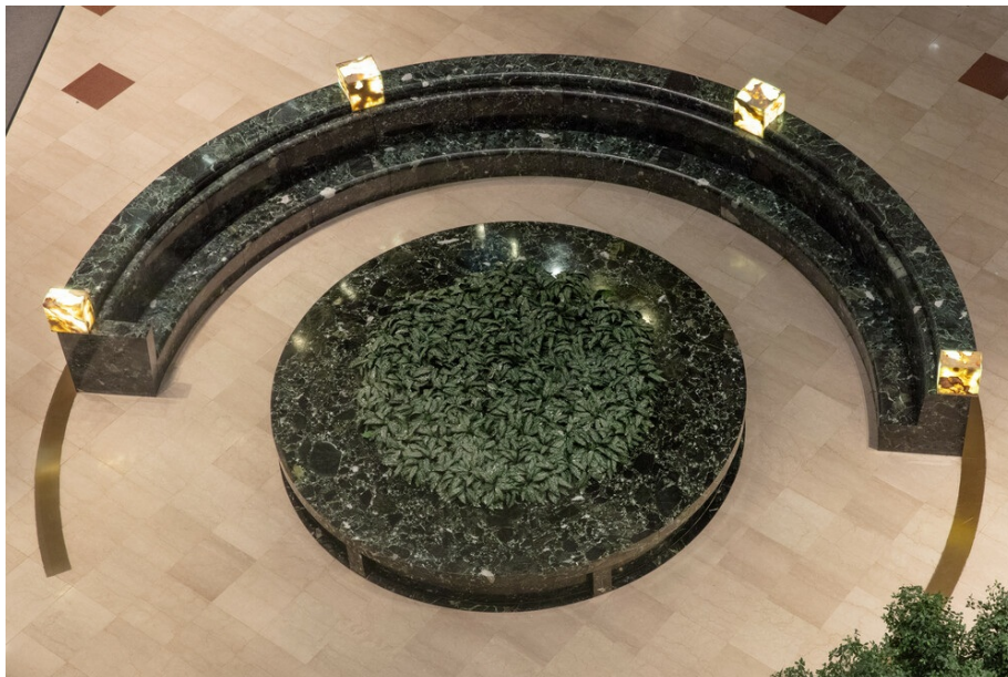
Fig. 3 Atrium Furnishment , by Scott Burton. 1986. Semi-circular verde larissa marble bench with four onyx lights and inset brass floor element surrounding a verde larissa marble circular table with a fountain (later a planter), diameter 12.1 m. (© Estate of Scott Burton; courtesy Kasmin Gallery, New York).

While conforming to today's institutional protocols, such a presentation initially seems antithetical to Burton's aspirations for a relational art that prioritises direct encounters. To meet that challenge, Wilcox and Smith mimicked a display methodology that Burton conceived when he first substituted found furniture in lieu of human bodies in his performance work. More than props, chairs, settees and tables become agents that, in structuring and vivifying the tableaux, provoke dialogue. In his masterly Pastoral Chair Tableau FIG.8, the furniture, arranged by type into a trio, a couple and a single lone member, is dispersed across a stage. The bucolic allusions are limned by a carpet of artificial grass, and a sky-blue curtain that serves as a backdrop. Animated by the meticulous spacing, amplified by the stylistic codes of the furniture's designs, a psychically charged conversation develops among the protagonists.