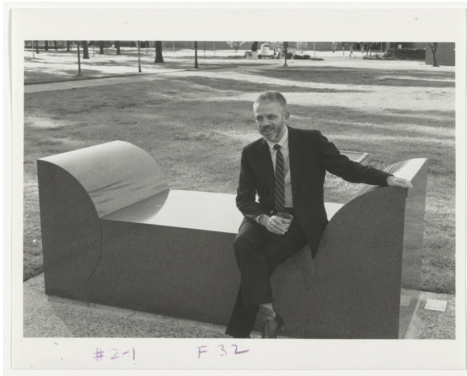
Fig. 1 Scott Burton sitting on a granite bench at the College of Architecture Building, University of Houston, in c.1986. Gelatin silver print, 20.3 by 25.4 cm. (© Estate of Scott Burton; Museum of Modern Art Archives, New York; Scala, Florence; Art Resource, New York; photograph Jonathan E. Jareb; exh. Pulitzer Arts Foundation, St Louis).

4 Most recently, the first comprehensive retrospective of the artist in four decades, Scott Burton: Shape Shift , opened at the Pulitzer Arts Foundation, St Louis. 5