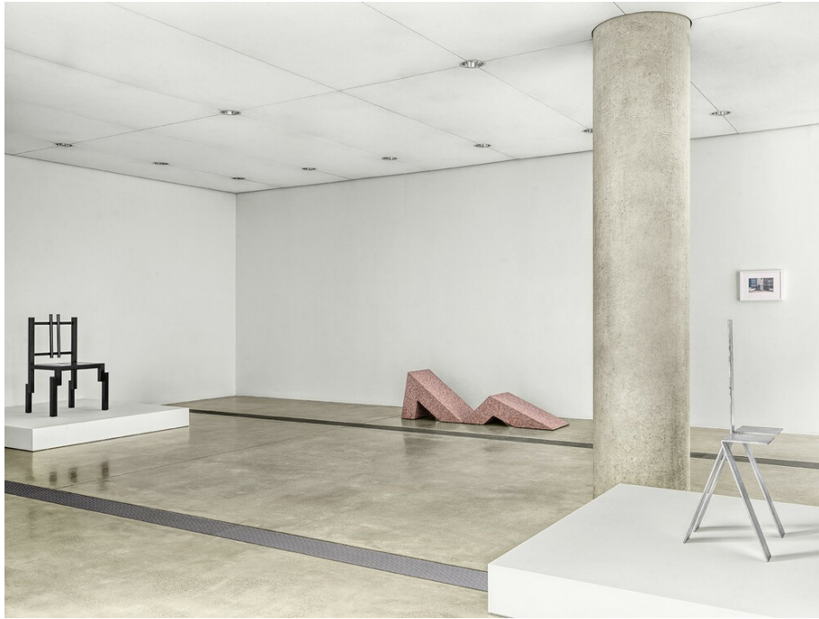
Fig. 10 Installation view of Scott Burton: Shape Shift at Pulitzer Arts Foundation, St Louis, 2024-25. (© Estate of Scott Burton; Artists Rights Society, New York).