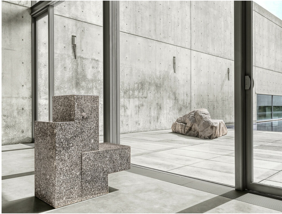
Fig. 12 Installation view of Scott Burton: Shape Shift at Pulitzer Arts Foundation, St. Louis, 2024–25, showing Two-Part Chair , by Scott Burton. 1986. Deer Island granite, 101.6 by 58.4 by 48.3 cm.; and Rock Settee , by Scott Burton. 1988–90. Granite, 90.1 by 269.2 by 158.8 cm. (© Estate of Scott Burton; Artists Rights Society, New York; photograph Alise O'Brien).