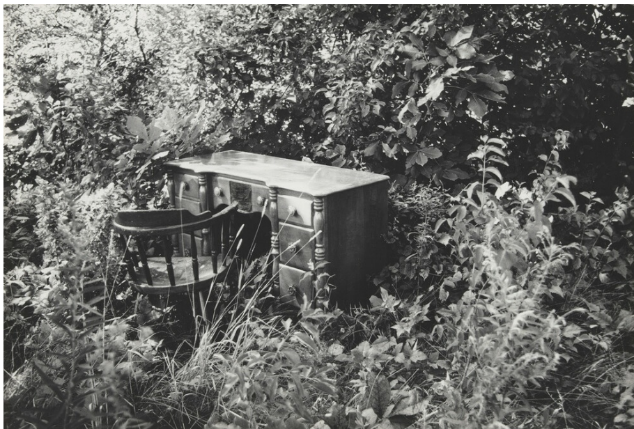
Fig. 5 Furniture Landscape , by Scott Burton. 1970. (© Estate of Scott Burton; Museum of Modern Art Archives, New York; Scala, Florence; Art Resource, New York; exh. Pulitzer Arts Foundation, St Louis).

Burton's legacy from different perspectives. In Fernandes's elusive glancing choreography FIG.15 FIG.16, performers infused their interactions with a tender self-consciousness redolent of a contemporary perspective. In his haunting text-based work, Hall placed the condition of waiting, with its relational dynamic, centre stage in Burton's practice. Read while seated at different vantage points across the gallery, his script addressed its subject through philosophical, anthropological and personal frames.