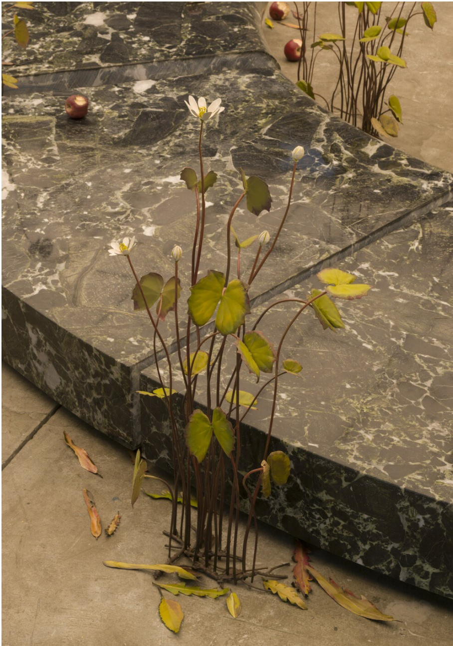
Fig. 4 Installation view of Álvaro Urbano: TABLEAU VIVANT at SculptureCenter, New York, 2024–25. (Courtesy the artist and SculptureCenter, New York; photograph Charles Benton).

neighbourhood context: a decoy for Burton's first solo exhibition at the gallery, where Pastoral Chair Tableau was staged.