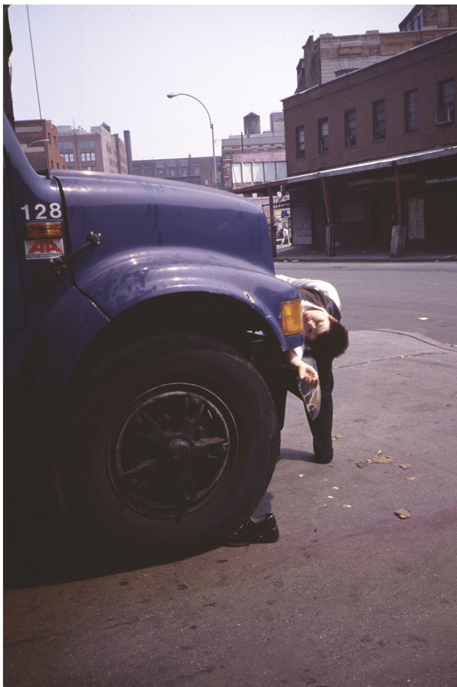
Fig. 6 History Lessons , by Barbara Hammer. 2000. 16mm film. (Courtesy the artist; exh. Whitney Museum of American Art, New York).

Exhibition details Whitney Biennial 2019 Whitney Museum of American Art, New York 17th May–22nd September 2019