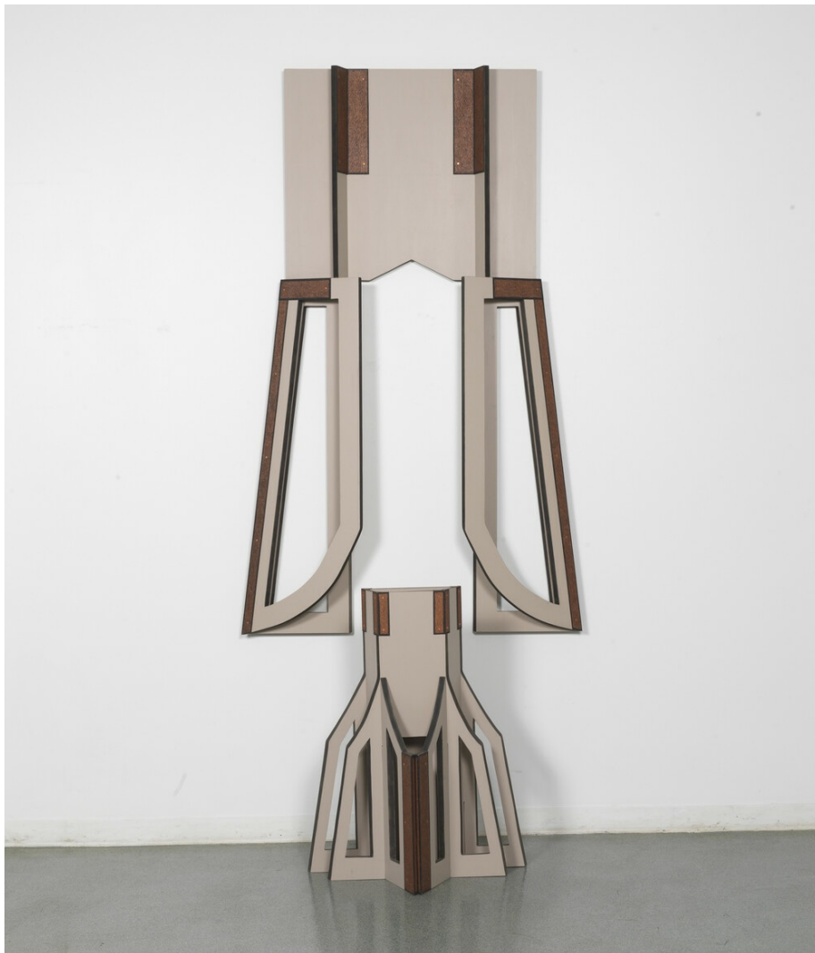
Fig. 2 Lambrequin and Peplum , by Diane Simpson. 2017. Painted fibreboard, crayon on polyester and copper tacks, 276.9 by 127 by 78.7 cm. (Courtesy the artist; photograph Tom Van Eynde; exh. Whitney Museum of American Art, New York).

photographic series of activities that push the body – including from facial feminisation surgery, the word 'DYKE' carved into someone's thigh, a hand holding a testosterone tube, alongside several subjects returning the camera's gaze defiantly – fuses portraiture with a millennial, Instagram-trained eye to put forward an effective revival of identity politics. The catalogue describes Pérez's photographs beautifully: 'they are reflections upon the failure of appearances to align with identity, imaging the beauty and truth found in those gaps and tensions' (p.294). Another young photographer known for queer self-awareness – slightly off the main space in a mustard painted corridor – John Edmonds, presents more classically sensual studio photographs, which question Black body objectivity and identity through object placement and composition.