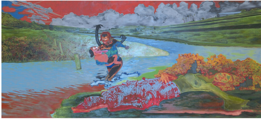
Fig. 4 Uh Oh, Look Who Got Wet , by Janiva Ellis. 2019. Canvas, (Courtesy the artist; exh. Whitney Museum of American Art, New York).