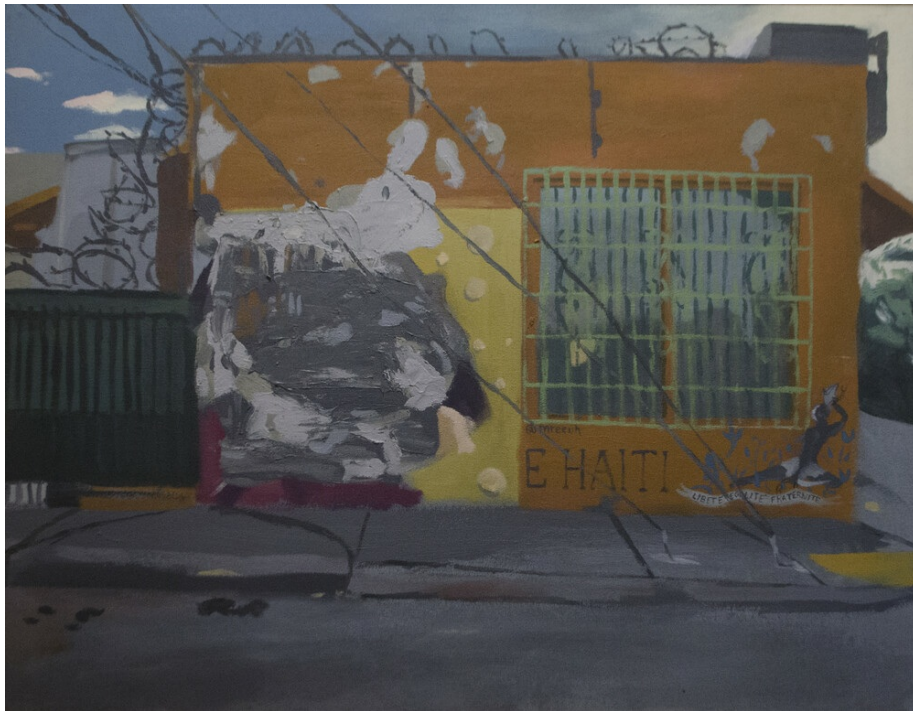
Fig. 5 5825 NE 2nd Ave., Miami, FL 33137 , by Eddie Arroyo. 2017. Acrylic on canvas, 71.1 by 91.4 cm. (Courtesy the artist and Spinello Projects, Miami; photograph Eddie Arroyo; exh. Whitney Museum of American Art, New York).