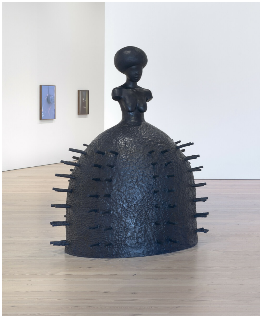
Fig. 1 Installation view of the Whitney Biennial 2019, showing Stick, by Simone Leigh. 2019. ( ; exh. Whitney Museum of American Art, New York).