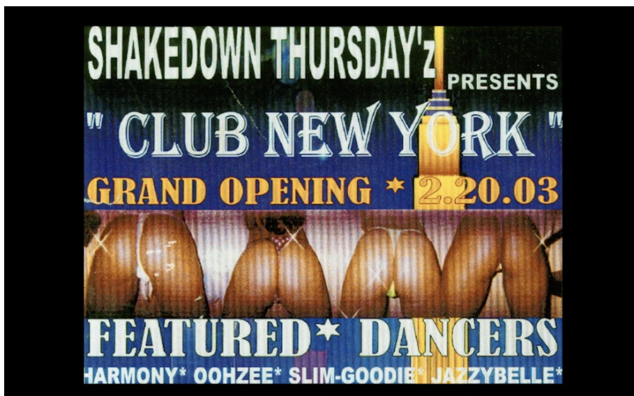
Fig. 3 Still from Shakedown , by Leilah Weinraub. 2018. Duration 1h 11m.

Early in the film, Weinraub asks Egypt if she was popular in high school. Egypt answers, ‘very,’ after which Weinraub asks if she was gay. Egypt explains that she was not, and that she behaved aggressively towards those she suspected were. The strength of scenes like these emerges both immediately, as Weinraub leans into her own narrative voice to position popularity alongside sexuality, and over time, as one reencounters Egypt seated alongside her long-term girlfriend and explaining matter-of-factly that her celebrated club persona is a site of ‘fantasy’ and liberating invention FIG. 5. Egypt’s adolescent bias towards gayness contrasts vividly with her lived experience on-camera and her magnetic confidence in the club FIG. 6. The contrast reveals a record of change that shares a feeling of introspection with viewers. Rather than limit herself to a static opinion about identity, Egypt conveys a resonant mixture of mutability, discretion and surprise.