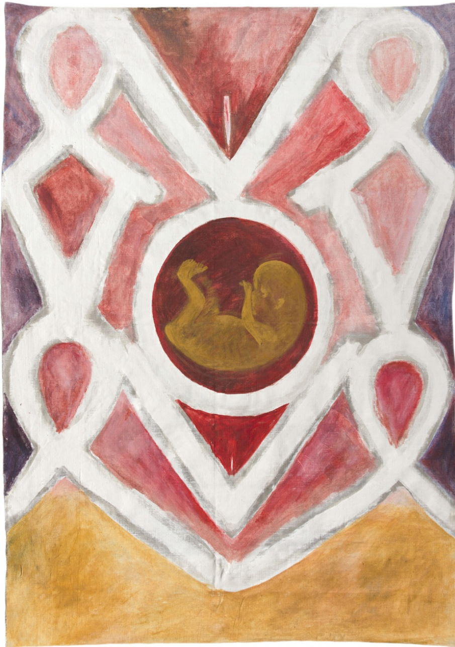
Fig. 2 Untitled (EVE) , by Luchita Hurtado. c.1970s. Acrylic and oil on canvas, 124.5 by 87.3 cm. (exh. Serpentine Sackler Gallery, London).