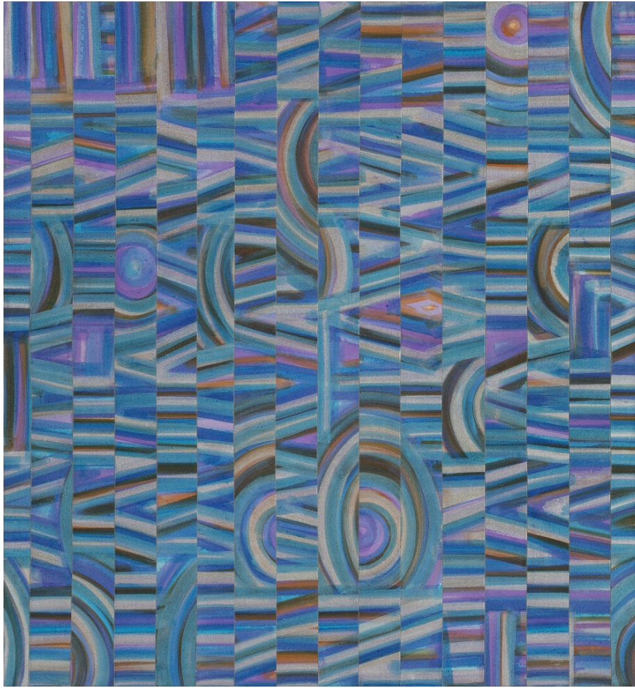
Fig. 3 Face for Arcimboldo , by Luchita Hurtado. 1973. Oil on canvas, 189.9 by 189.9 cm. (Courtesy the artist and Hauser & Wirth; exh. Serpentine Sackler Gallery, London).