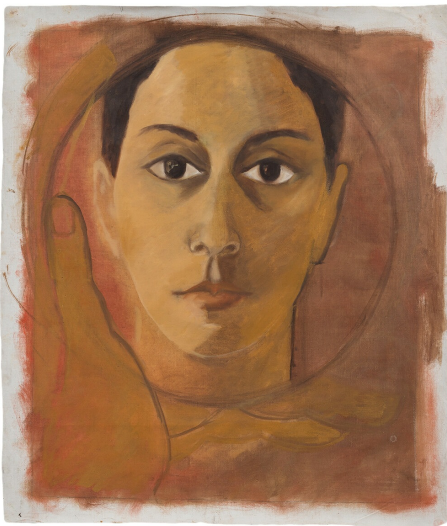
Fig. 5 Untitled (Self Portrait) , by Luchita Hurtado. c.1968. Oil on linen, 82.6 by 67.9 cm. (exh. Serpentine Sackler Gallery, London).