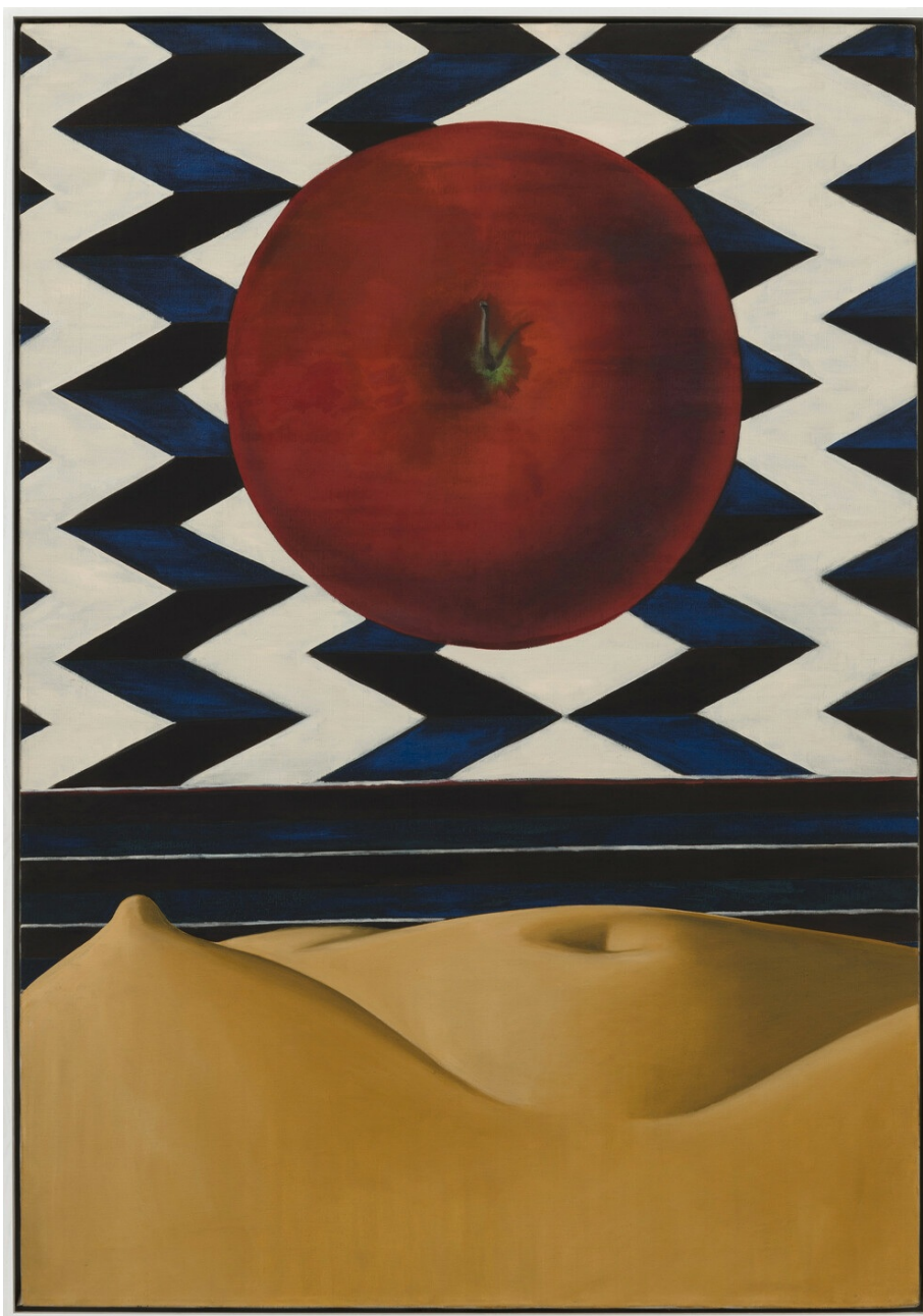
Fig. 6 Untitled , by Luchita Hurtado. 1971. Oil on canvas, 127 by 88.6 cm. (Courtesy the artist and Hauser & Wirth; exh. Serpentine Sackler Gallery, London).