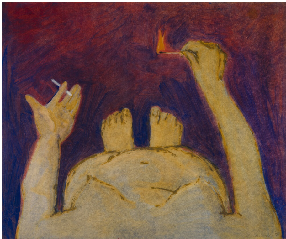
Fig. 1 Untitled , by Luchita Hurtado. 1971. Oil on paper, 64.8 by 77.5 cm. (Private Collection; exh. Serpentine Sackler Gallery, London).

Given that this is Hurtado's first solo exhibition in a public institution, the single-artist focus is in many ways laudable, and an important political move in its own right. But even within the parameters of a retrospective, it is possible to get a sense of with whom and what an artist might be in dialogue. These conversations are a constitutive part of Hurtado's practice, but there is relatively scant reference to them here. Nevertheless, the force of Hurtado's painting and drawing ensures that her deep and ongoing exploration of the relationship between the individual and the collective comes powerfully across.