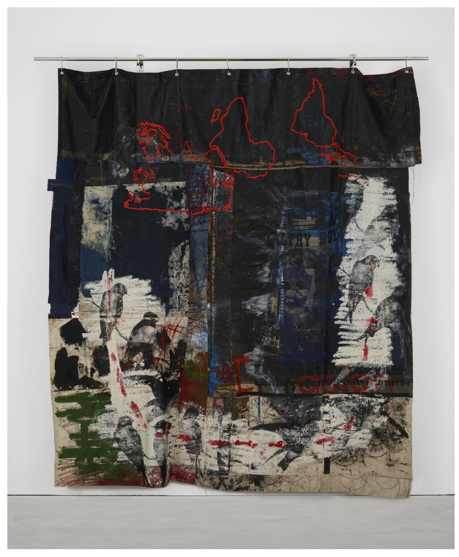
Fig. 2 Violent Amnesia , by Oscar Murillo. 2014–18. Graphite, oil, oil stick, grommets and stainless steel on canvas and linen, 300 by 164 by 15 cm. (© Oscar Murillo; exh. Kettle's Yard, University of Cambridge).

The second of the main gallery spaces at Kettle's Yard is hung with paintings from the artist's Catalyst series FIG.7. These are different in character to the rest of the works included in the exhibition. Created via a less direct method of working, they emerge from a process akin to monoprinting, a rudimentary printmaking technique. A 'master' canvas is laid on the floor and saturated with paint before a second canvas is placed on top and paint transferred between the two using a broom handle. What results from this idiosyncratic procedure are canvases filled with a web of marks, recording the frenzied movements of the broom handle across the back of the second canvas. Since Murillo cannot see how his painting is developing while making it, the final appearance of each work in the series is somewhat accidental. The process seems to be more important than the outcome here: the intense periods of physical activity through which works from the catalyst series are produced act as a kind of therapy, perhaps Murillo's