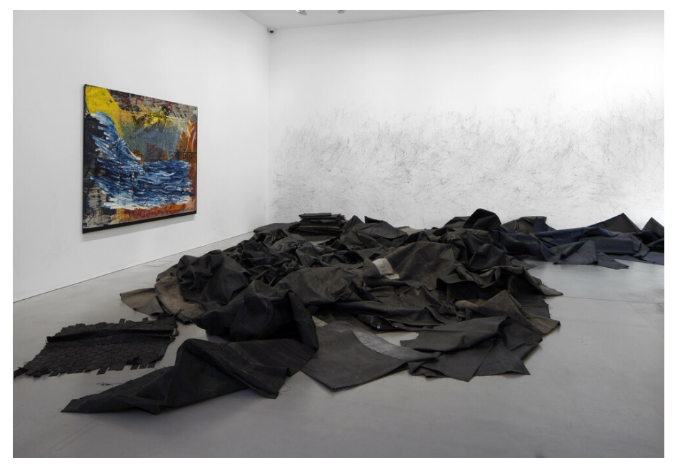
Fig. 5 Installation view of Oscar Murillo: Violent Amnesia at Kettle's Yard, University of Cambridge, 2019.