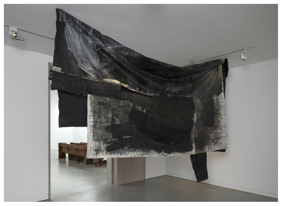
Fig. 4 Installation view of Oscar Murillo: Violent Amnesia at Kettle's Yard, University of Cambridge, 2019.