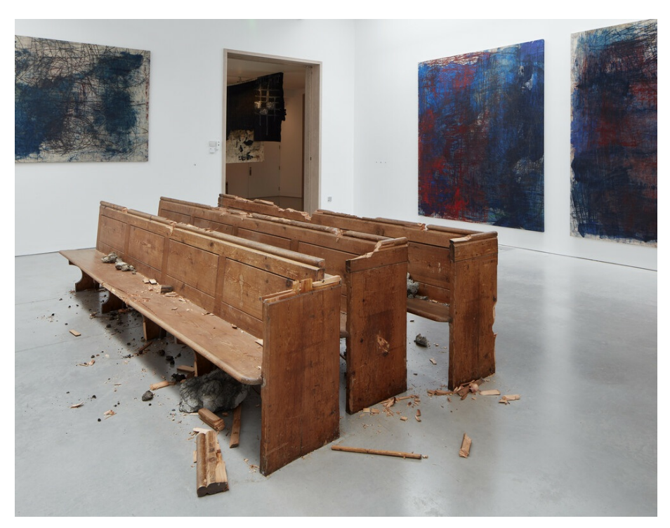
Fig. 3 Installation view of Oscar Murillo: Violent Amnesia at Kettle's Yard, University of Cambridge, 2019.

means of dealing with the anxieties he feels about the state of the world.