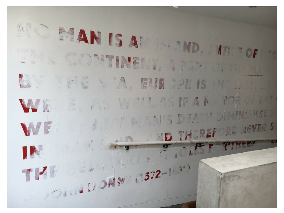
Fig. 1 Installation view of Oscar Murillo: Violent Amnesia at Kettle's Yard, University of Cambridge, 2019.

Needless to say, not all visitors to Violent Amnesia will make the connection between investigations into the potential of canvas seeped in black paint and the artist's anxieties about global inequality. They may simply enjoy the physical properties of Murillo's work: delighting in the intensity of the artist's mark-making and uninhibited use of materials. The raw smell of paint still pervades the gallery speces, indicating that some of the pieces are not yet dry. It is as if the artist has only temporarily stopped painting and could return to add further marks to them. Whether making objects in two or three dimensions, Murillo does not seek to resolve the final appearance of his compositions; they remain provisional, in a state of flux.